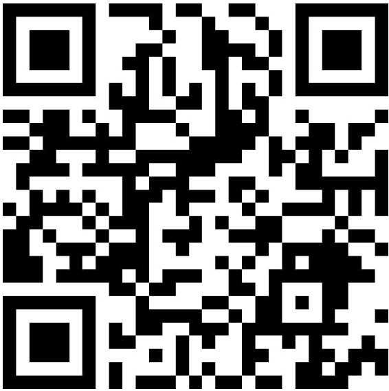
MGU FYUGP Regulations, 2024